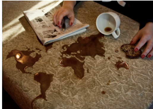
table. On closer inspection, these little specks turned out to be people, tiny little people, all feverishly and tirelessly building their world on her table-top. Before long, tiny buildings had been constructed, forests and mountains had grown, and there were even little vehicles making their way across coffee-stained continents.

Would you keep it a secret or will you tell everyone?